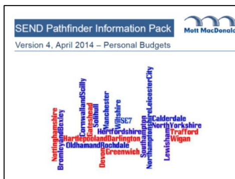
Figure 2 Personal Budgets Information Pack

A glossary of terms has been developed by KIDS with In Control, OPM and others as part of their Making It Personal vii DfE funded work. This work also includes a set of case studies, information for families, young people, providers and for commissioners.